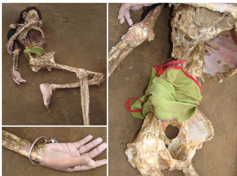
Fig. 4 Forensic artefacts in a cadaver caused by Calophysus macropterus . Skeletonization of the body and preservation of the cartilage, the eyeballs, the scalp and the extremities of the limbs were observed

waiting nets [9], differing only in their attack and feeding strategies. Cetopsis candiru devours tissues using a swift rotating movement that is similar to a drilling machine. The fish creates one to a few small holes (Fig. 1) in the outer surface to enter the body, which is often devoured from the inside out. It can remain inside the body for a long time, resulting in a feeding frenzy that can attract tens to hundreds of individuals that sometimes completely fill the interior of the cavities with a swirling mass of vermiform fish [9]. In contrast, Cetopsis coecutiens usually performs rapid attacks on prey,