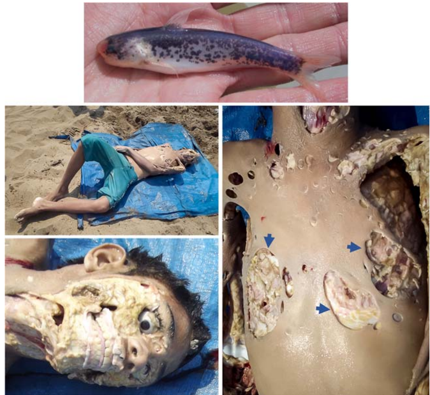
Fig. 1 Forensic artefacts caused by the Cetopsis genus in a cadaver, most likely due to Cetopsis candiru . Arrows highlight the outer surface artefacts used by fish as the entrance to the carcass

to acknowledge the child, presumably because he was a married man (Fig. 4). The victim was recovered 17 h after drowning. The skeletonization of the body along with the preservation of the cartilage, eyeballs, scalp and the extremities of the limbs suggested the feeding actions of Calophysus macropterus . The length of this species ranges from 19 to 71 cm and it has a wide