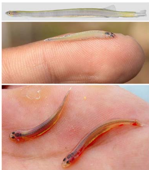
Fig. 5 Vandellia cirrhosa , a hematophagous fish known as “vampire fish”

Other species have been anecdotally associated with devouring cadavers, but most reports failed to provide scientific evidence of their involvement. Vandellia cirrhosa (Fig. 5) of the Trichomycteridae family is also called “candiru” by the Amazon natives and it is one of the best-known fish species in Brazil [15, 16]. It is a small and transparent fish that is quite difficult to spot in the turbid waters of its home; it is approximately 2.5–6 cm long and is known by the common name “vampire fish” as they are hematophagous and feed on blood from the gills of larger fish gills [4, 15]. An